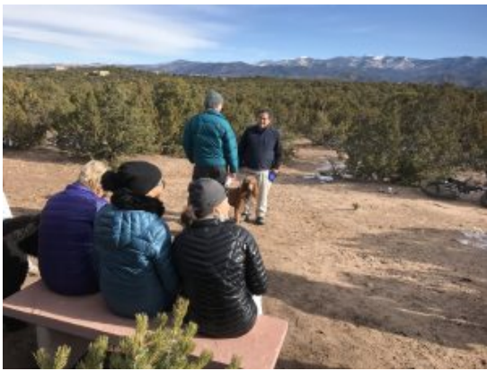
The view of the "end of the Rockies"