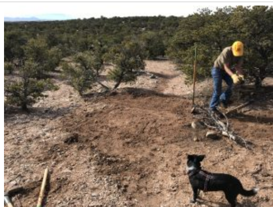
Finishing touches on a grade reversal, Dec. 11