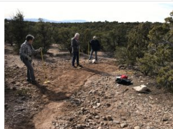
End of a great year of work on city trails – thank you, volunteers!